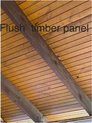
Flush timber panel