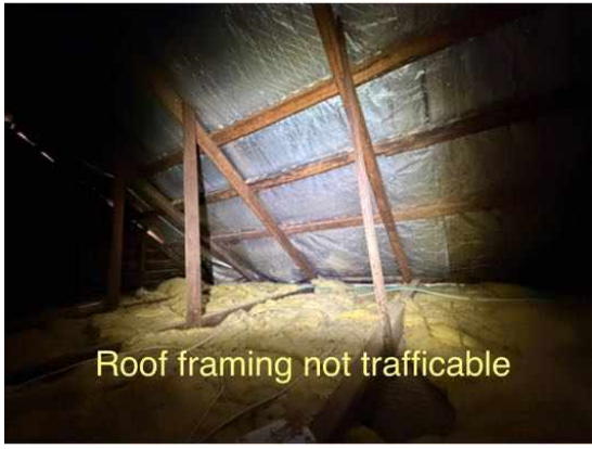
Roof framing not trafficable